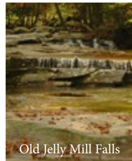
Old Jelly Mill Falls

Old Jelly Mill Falls is a series of small waterfalls. It is a great place to have a picnic and wade (use caution on the very slick rocks in the water). Don't forget to walk up and down West Street to get a good feel for West Dummerston Village.