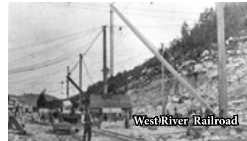
West River Railroad

Location: Park along the road near 971 Rice Farm Road (1/2 mile south of the Green Iron bridge). The trail is on the river side of the road. There is a small gate. Due to bridge construction, the trail may sometimes be closed.